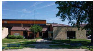
Malone Community Center and site of El Centro de las Americas

When El Centro de las Americas decided to relocate this past year, the Malone Community Center welcomed El Centro as its new co-tenant in the building that Malone has resided in since 1982. The colocation has been a success for both the leadership and their clients and, as a result, the Coalition is now exploring